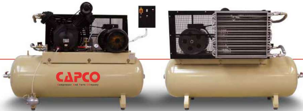
Premium Range Illustrated

11 bar receiver mounted, 14 bar base mounted.